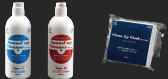
For cleaning For finishing