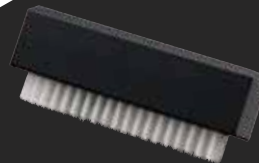
0.02 mm microfine brush